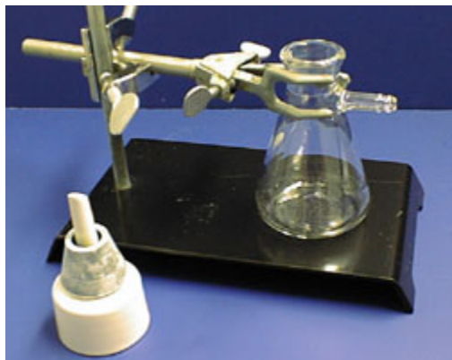
clamp a side arm flask securely to a ring stand

Check the side arm flask (filtering flask or vacuum flask) carefully for cracks, since cracks could cause the flask to break when vacuum is applied. Then, clamp the flask securely to a ring stand. Add an adaptor and a Buchner funnel . Place a piece of filter paper in the funnel that is small enough to remain flat but large enough to cover all of the holes in the filter.