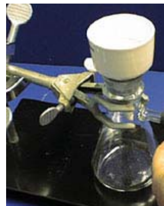
connect the side arm flask to a vacuum source - always use thick-walled tubing , since Tygon tubing will collapse under reduced pressure