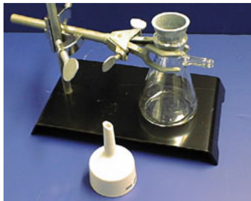
place the rubber adaptor in the side arm flask