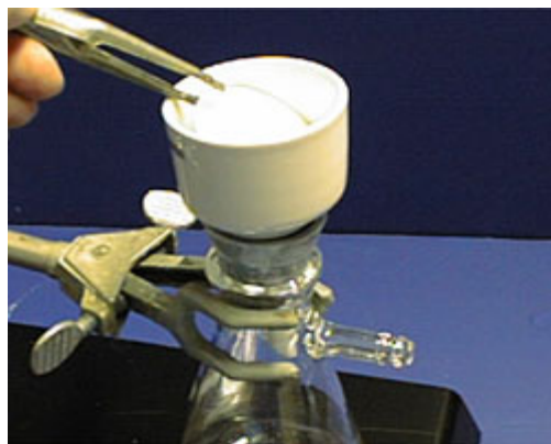
. . . and put it in the Buchner funnel