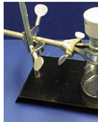
place the Buchner funnel on the adaptor